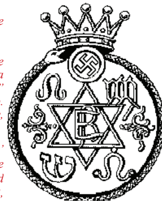
Brooch of Blavatsky